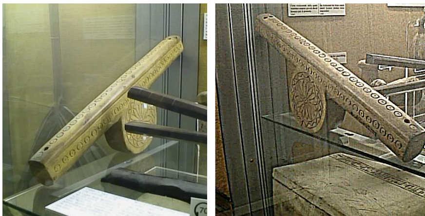
Fig.2 In a previous preparation of the items found in the Kha's Tomb at the Egyptian Museum, it was possible to see the front and back of the object. They are the same.